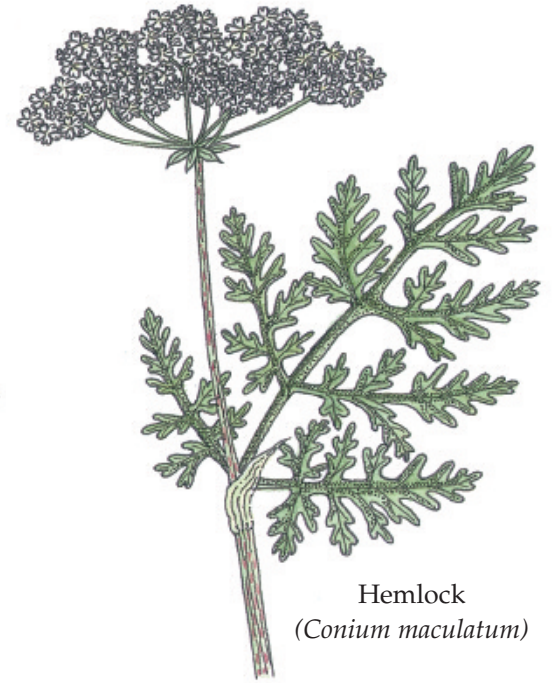
Hemlock ( Conium maculatum )