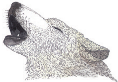
The Grey Wolf Howling ( Canis lupus )